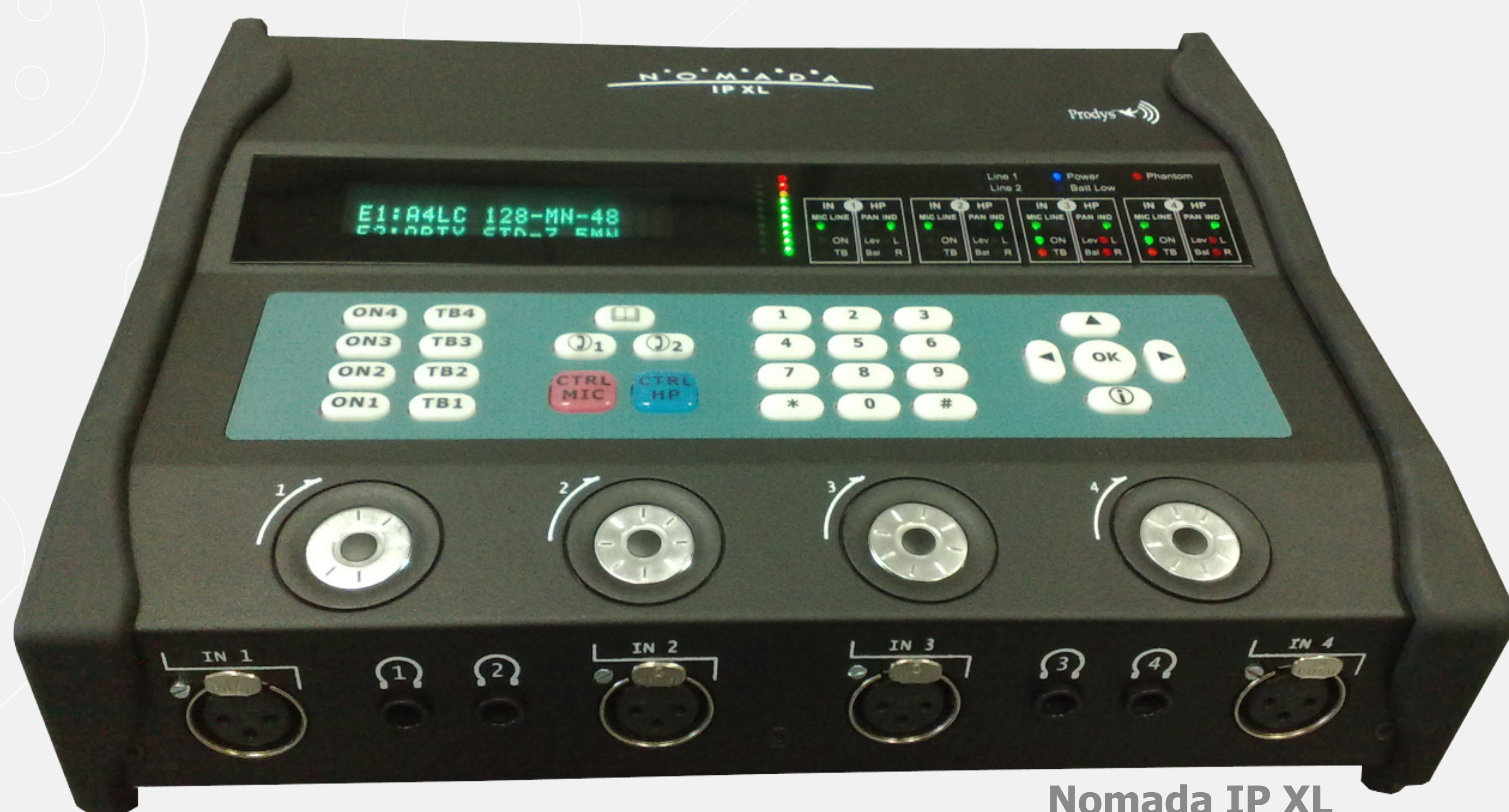
Nomada IP XL

Nomada IP XL: portable audio codec with 4 audio inputs.