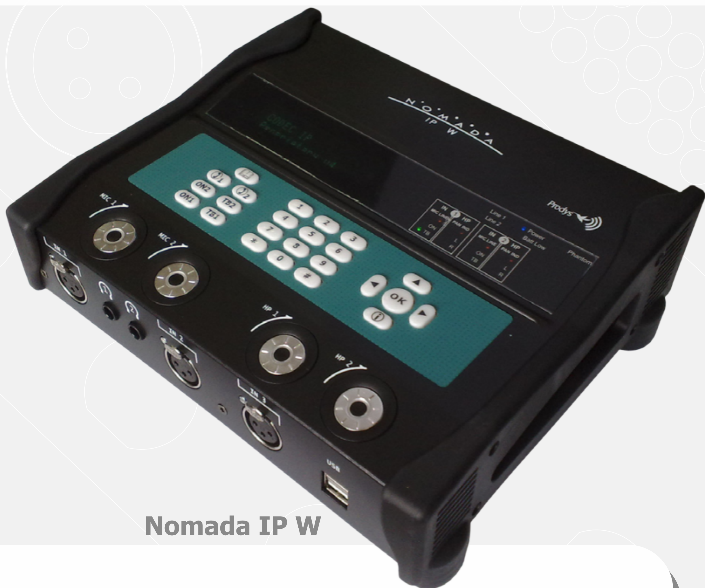
Nomada IP W